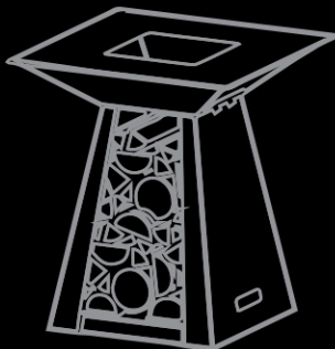
Quadro Basic Medium