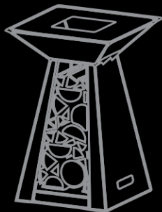
Quadro Basic Small